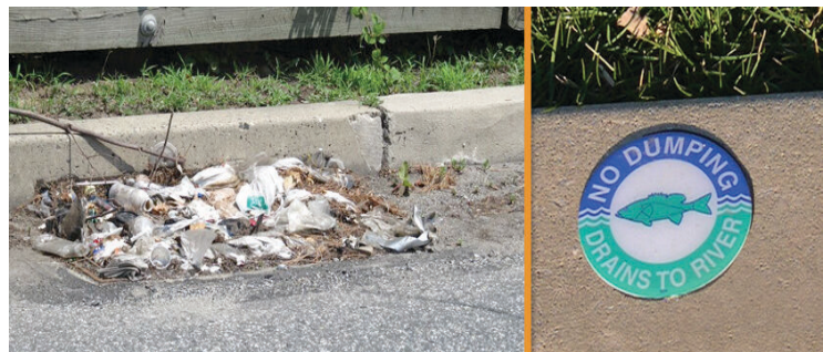
Storm Drain that will not work due to debris

MS4 -STORM WATER- the supervisors will have a special presentation regarding Stormwater on August 7, 2025 at 7 p.m.