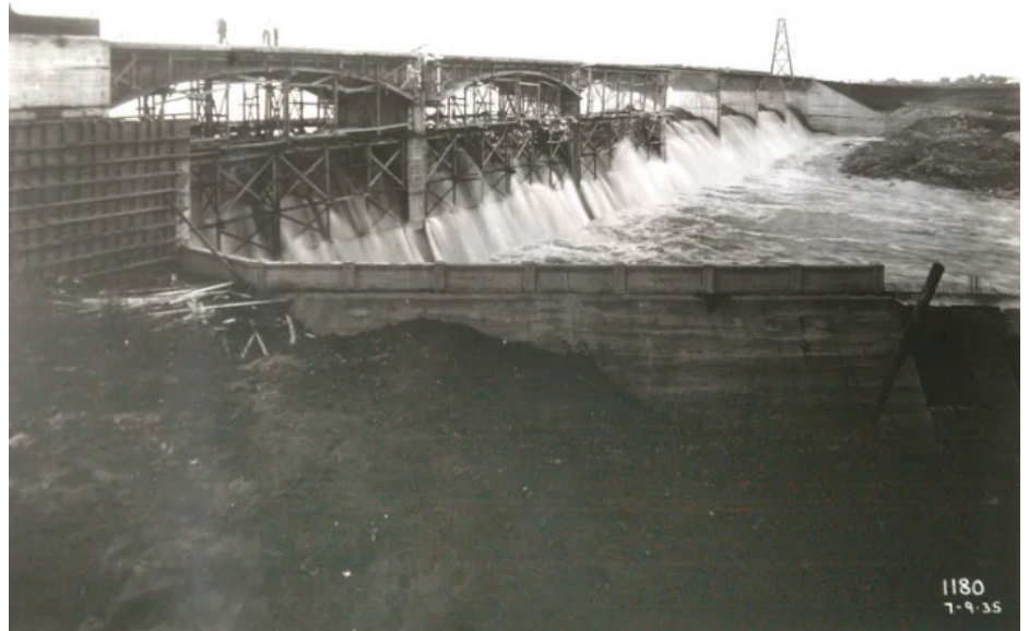
Ground was broken for Ontelaunee Lake in 1926, and the dam was completed in 1933.

OFFICES ARE CLOSED: April 18, May 20, May 26, July 4, September 1