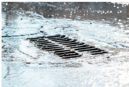
Working Storm Drain

There are steps that everyone can take to reduce the number of pollutants - trash, debris, pet waste, and chemicals - carried by stormwater. The most basic way to help is to never dump anything you wouldn't drink or swim in down a storm drain. Other ways to help include picking up pet waste, properly disposing of household chemicals such as paints and cleaning supplies, sweeping driveways and sidewalks instead of hosing them, and washing cars at car wash facilities or on lawns rather than in driveways, and keeping inlets and swales clear of debris and leaves. The next time it rains, consider where the stormwater drains!